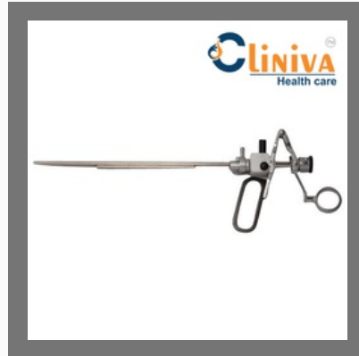
Active Working Element