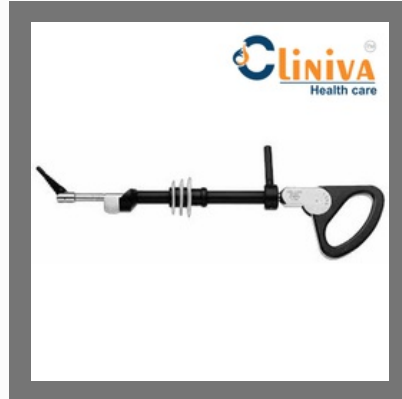
Storz Type Uterine Manipulator