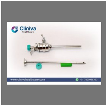
Laparoscopic Trocar Cannula