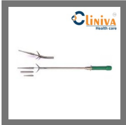
Mangeshikar Uterine Manipulator