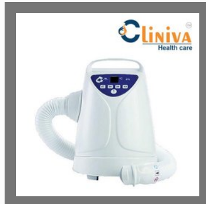
3M Patient Warming Unit