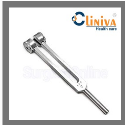
Cliniva Healthcare ENT Tuning Fork