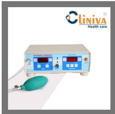
Cliniva Healthcare Digital Tourniquet Machine