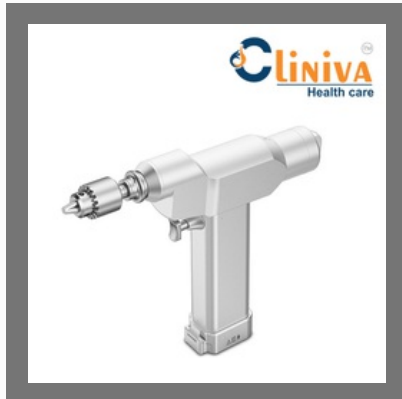
Battery Operated Bone Drill