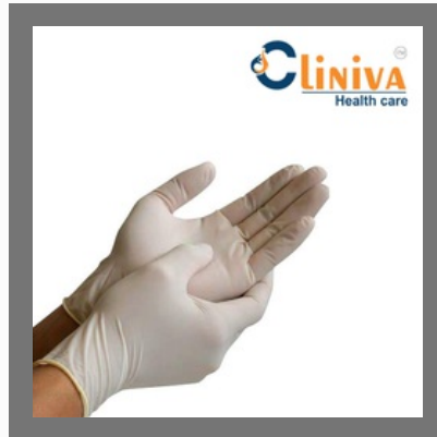
Cliniva Healthcare Latex Examination Gloves