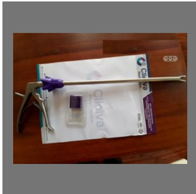
Stainless Steel Reusable Hemo Lock Clip Applicator