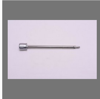
10 Mm Safety Trocar