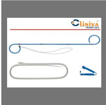
Double J Stent Set