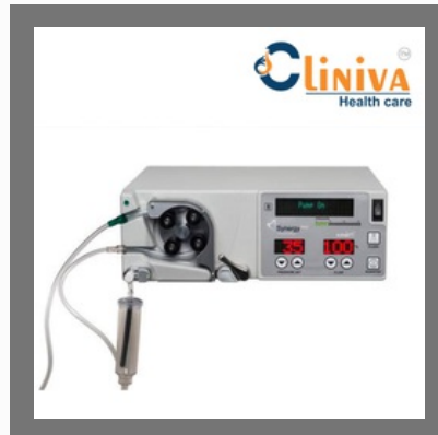
Cliniva Healthcare Arthroscopy Irrigation Pump