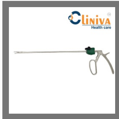
Laparoscopic Clip Applicator