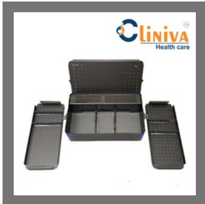
Orthopedic Sterilization Box