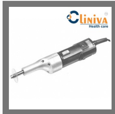
Cliniva Healthcare Electric Plaster Cutter