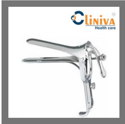
Gynecology Vaginal Speculum