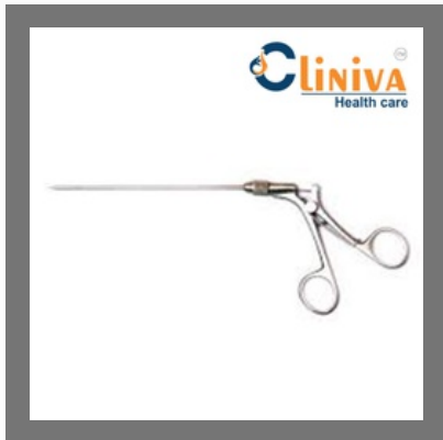
Port Closure Needle