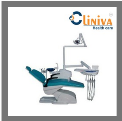
Electrically Operated Dental Chair