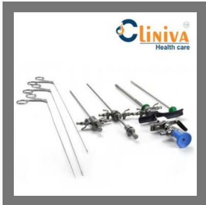
Operative Hysteroscopy Set