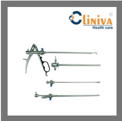
Stone Punch Set