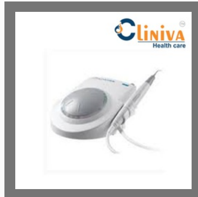
Ultrasonic Dental Scaler