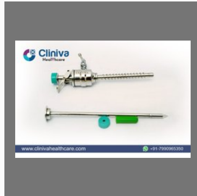
Laparoscopic Spiral Trocar Cannula