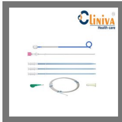
PCN Catheter Set