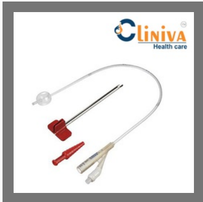
Suprapubic Catheter Set