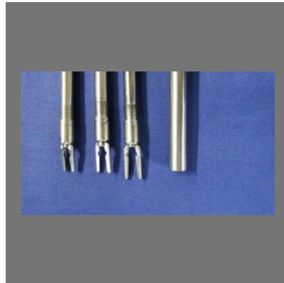
Laparoscopic Clip Applicator 3 In 1