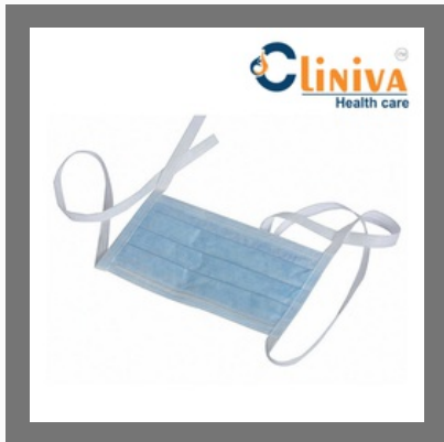
Cliniva Healthcare 2 Ply Face Mask